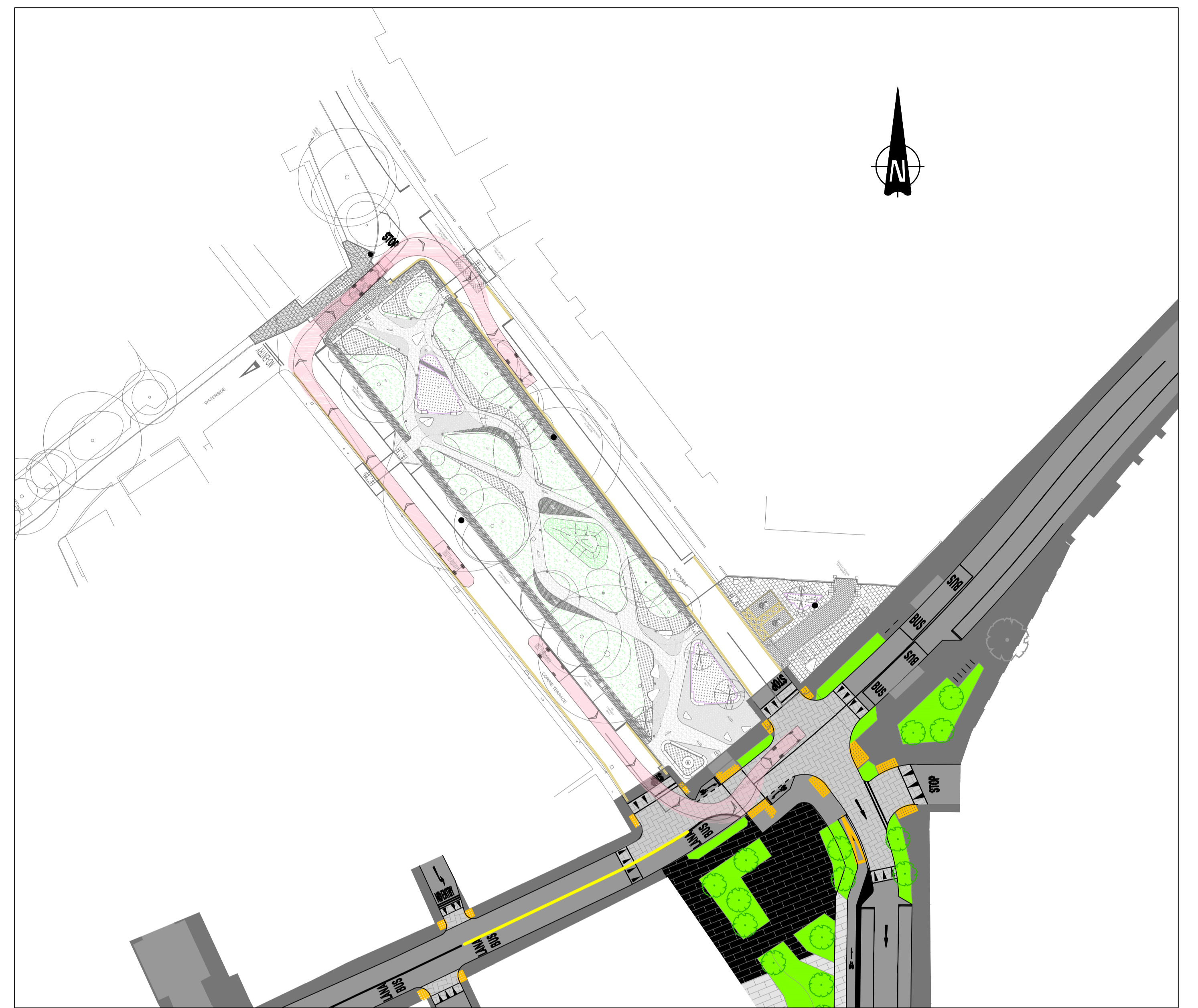
DETAIL 2 SCALE 1:500