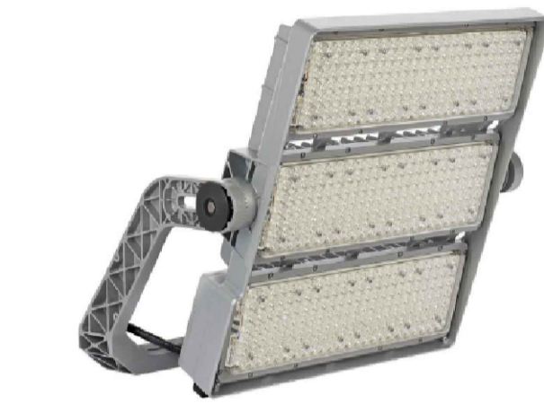
LED Floodlighting & Bracket Scale: NTS