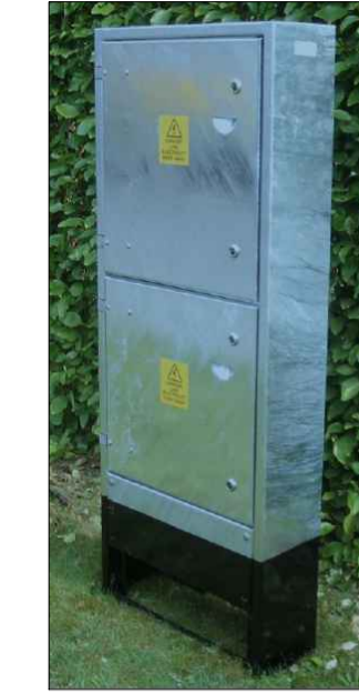
Three/Single Phased Metered Pillar 1270mm High x 600mm Wide x 225mm Deep Please refer to enclosed Piltown Engineering Information Sheet