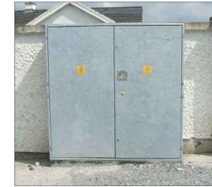
Distribution Pillar Double Door 1600mm High x 1600mm Wide x 450mm Deep Please refer to enclosed Piltown Engineering Information Sheet