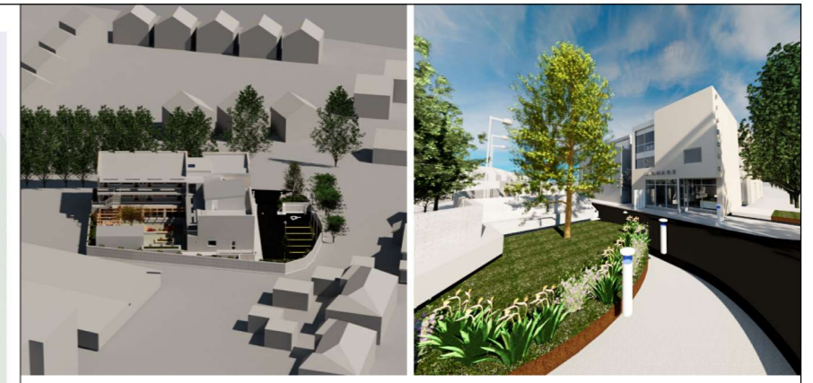
SITE CONTEXT FRONT ENTRANCE / PUBLIC ARTS PLAZA