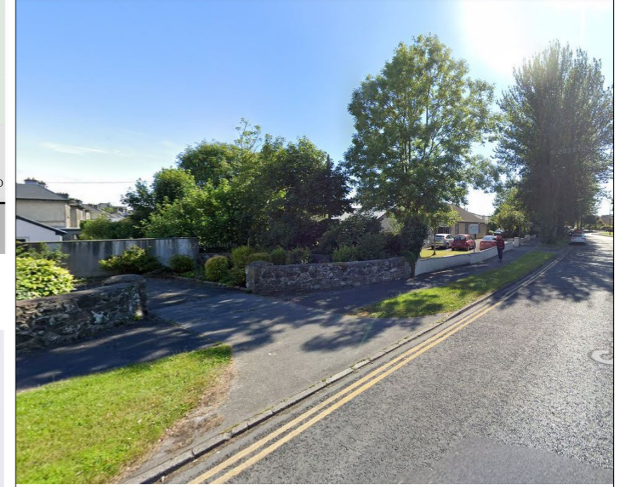
RESIDENTIAL AREA TO EAST SCREENED WITH EXISTING PLANTING