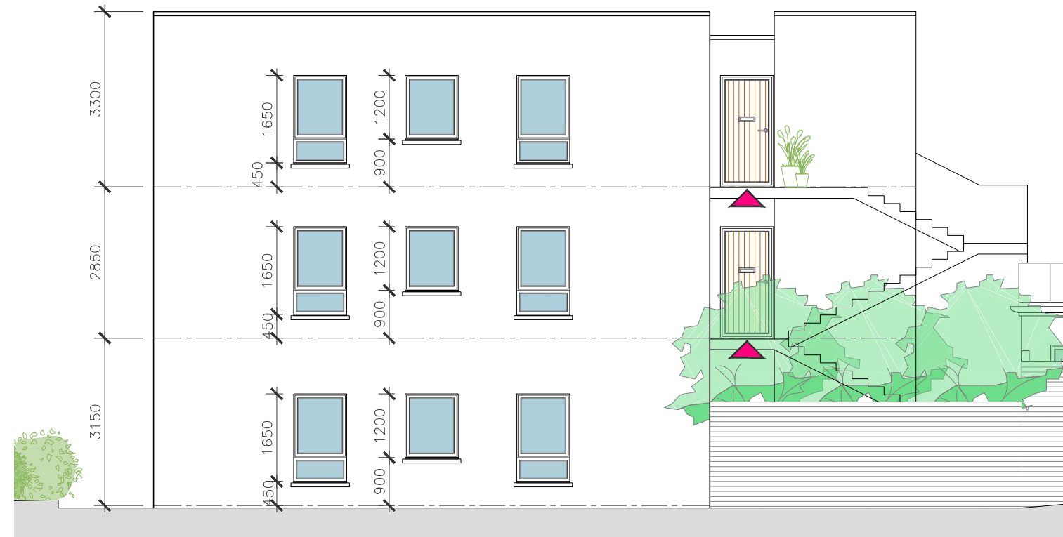
EAST ELEVATION Scale 1:100