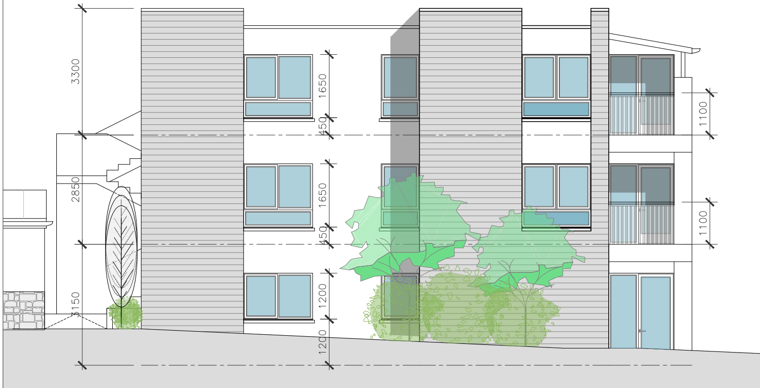
WEST ELEVATION Scale 1:100