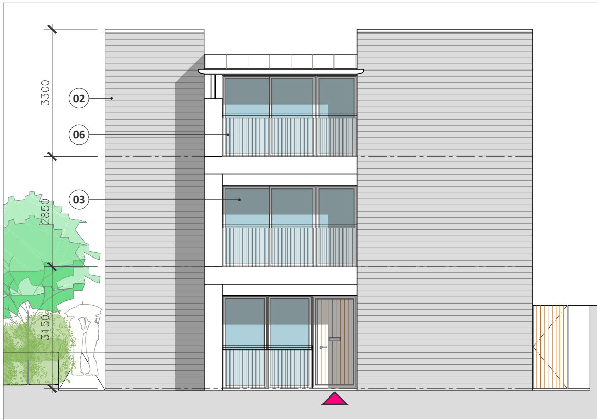
SOUTH ELEVATION Scale 1:100