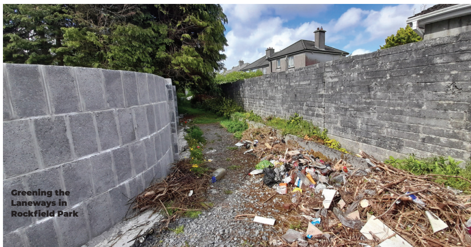
Greening the Laneways in Rockfield Park

In October 2022, and supported by funding from the Anti Dumping Initiative 2022, Lough Corrib Navigation Trust carried out a litter pick of a section of the Eglinton Canal above Parkavara. Operatives hand-picked a large amount of waste material from the area, including (amongst other things) bicycles, wheels, clothes, furniture, an (empty) safe box, traffic cones, traffic signs, a shopping trolley and over 1 tonne of glasses, glass bottles and cans.