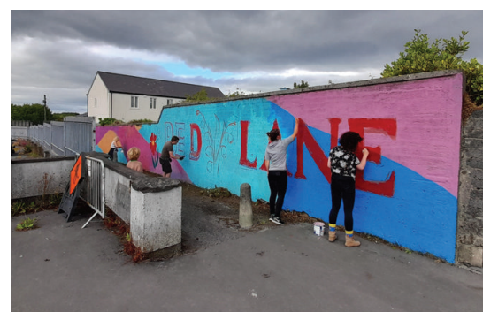
Communities coming together to take pride in their area. Photos from the Greening the Laneways Project 2022 in the Red Lane, Shantalla.

Your waste, your responsibility. For more information, check www.galwaycity.ie .